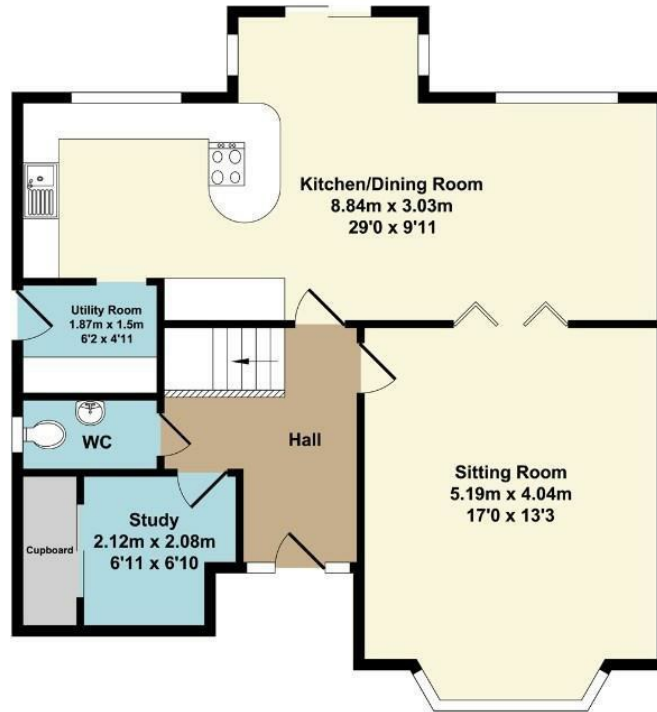
Ground Floor Approx. Floor Area 68.63 Sq.M. (739 Sq.Ft.)